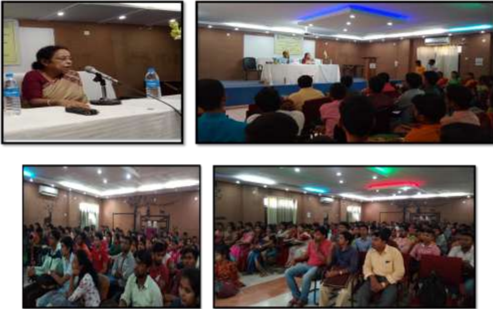
Fig.: Photographs w.r.t. the programme