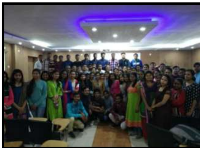
Students with the Resource Persons after the Lecture