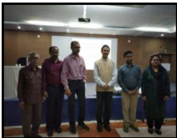
Faculty and Resource Persons